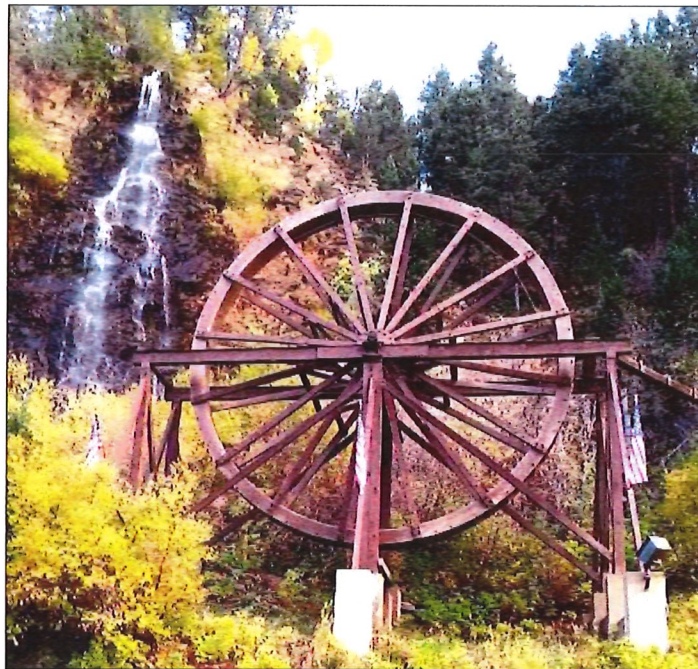
Restoration of Idaho Springs' iconic waterwheel is a result of the City's partnership with the Historical Society.

Among those accomplishments are the restoration and maintenance support of the Charlie Tayler Waterwheel, exterior restoration of the narrow gauge train and the construction and operation of the Idaho Springs Visitor Center that houses the history museum, including a US Forest Service information Office. Funds from multiple sources have already been secured to restore the Central Hose House and the Jackson Monument. All of the noted properties are City owned. The preservation of the City's historic